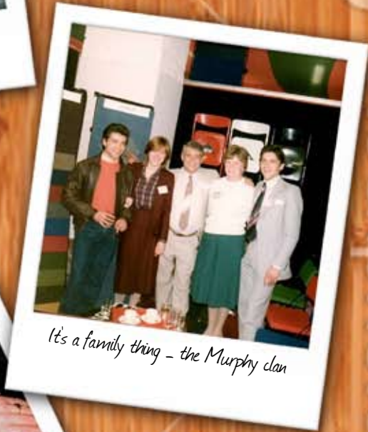
It's a family thing - the Murphy clan